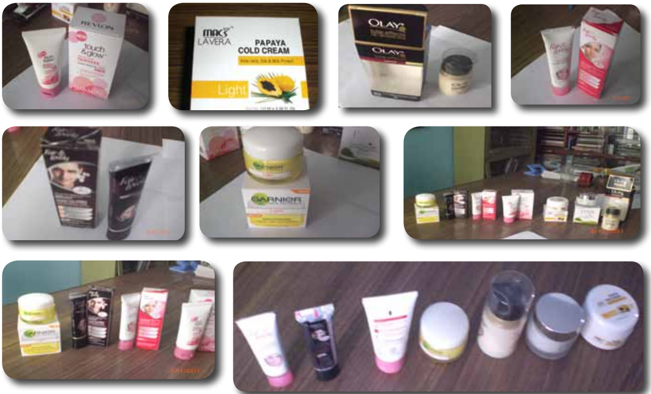
Sample of different brand of skin whitening creams tested for mercury

This study is based on the research carried out by Center for Public Health and Environment Development (CEPHED) on mercury contamination in skin whitening cream. CEPHED collected the seven samples of most commonly used brands of skin whitening creams that are most popular among Nepalese men and women around the market of Kathmandu. The samples collected from the market have its manufacturing date from 2010 to 2011. The collected samples were then coded and sent to Delhi Test House (DTH) (ISO-9000 and NABL Certified Laboratory) in India for the analysis of total amount of mercury in the samples. All the details of the samples were tabulated for the record as follows before these samples had been sent to lab.